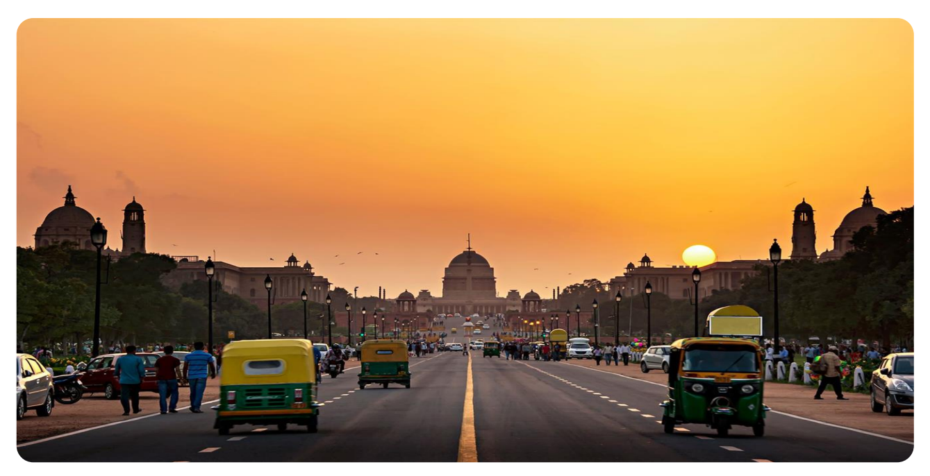
Reach Delhi early morning with lots of amazing memories and unforgettable experiences.